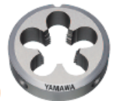
Solid die: D

In order to provide easy to use cutting dies to the market, Yamawa has converted the standard offering of cutting dies to solid dies. Cutting dies are not fixed as adjustable dies. There are two types of solid die and adjustable die specified in the JIS B 4451 Threading Round Die standard. The way cutting dies are used today, I think the most easy to use die is the solid die.